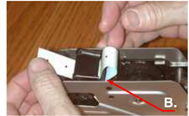
Pass labels through the slot in the printbase B.