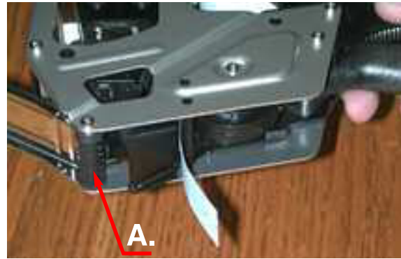
Note: When threading the labels do not pass them through the roller A.