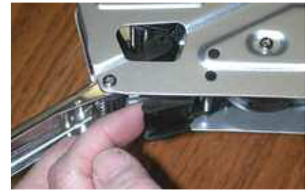
Pull down on the forward part of the printbase. This will open the path for the labels to pass through