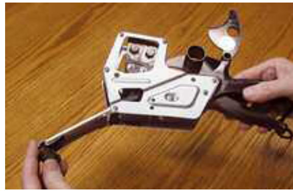
Ready to load

The Towa GL Price Marker is shown in the photos below. These instructions also apply to the Models GS and GH as well.